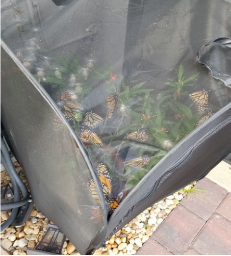
Butterflies ready to go