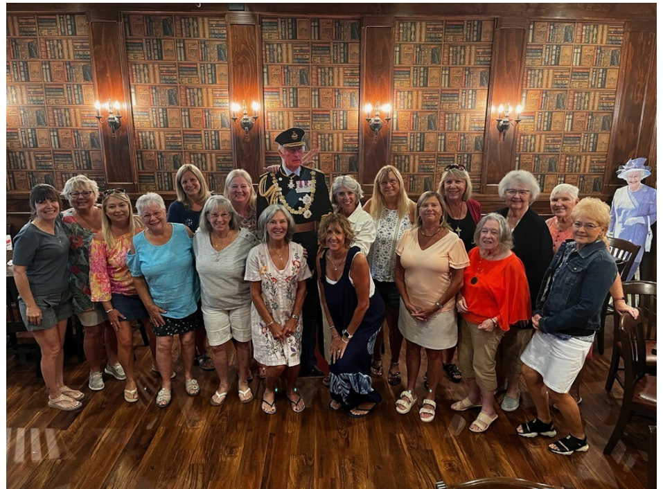
Ladies' Pre-Coronation Lunch with King Charles at British Pub