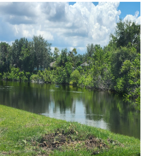
Look at this! No Stump!!!