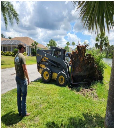
Pierce Drive Stump Removal